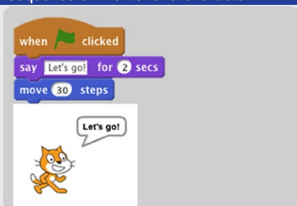
Figure 3 Coding Blocks Showing Sequence of Events for a Character

Another app that can be used to promote understanding of if–then