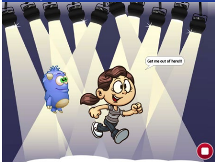
Figure 4 Creating a Visual Story Outline With Tynker

imagination who has been dreaming of her big day on the stage but is frightened away when she imagines that a purple monster is trying to sabotage her debut. This simple scene was created in Tynker by selecting preloaded backgrounds and characters, which served as story starters for the author by providing ideas about a story that could be created. (Tynker also provides an option to create scenes and characters from scratch without using preloaded templates.) The coding blocks were then sequenced to program the female character to say “get me out of here.” Figure 5 shows the Tynker interface and the programming blocks used for this scene. Figure 6 shows how scenes and characters were selected.