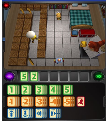
Figure 7 Logic and Reasoning in My Robot Friend

players are instructed to make a robot move in a directed way. The game is highly engaging, progresses through increasingly complex levels, and provides detailed instructions that help players progressively build programming skills. My Robot Friend primarily instructs players through visual images, but audio instructions are also provided throughout to introduce concepts and build the game narrative as the programming requirements, and correspondingly the story plot, become more complex. Accordingly, students must employ their visual and listening comprehension skills to navigate the game. Teachers can use this engaging game to help students learn programming logic and build a variety of literacy skills such as (1) learning to summarize visual and audio information by requiring students to summarize the game events and plot; (2) reporting on a topic and providing descriptive details to support main ideas and themes by having students interpret and orally report on the plot and themes presented in the game and present an opinion of the game; (3) comparing and contrasting characters and events by